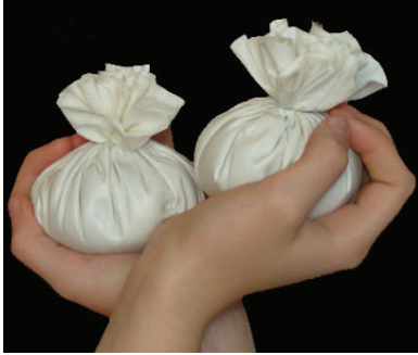
Thermal Palms® pouches